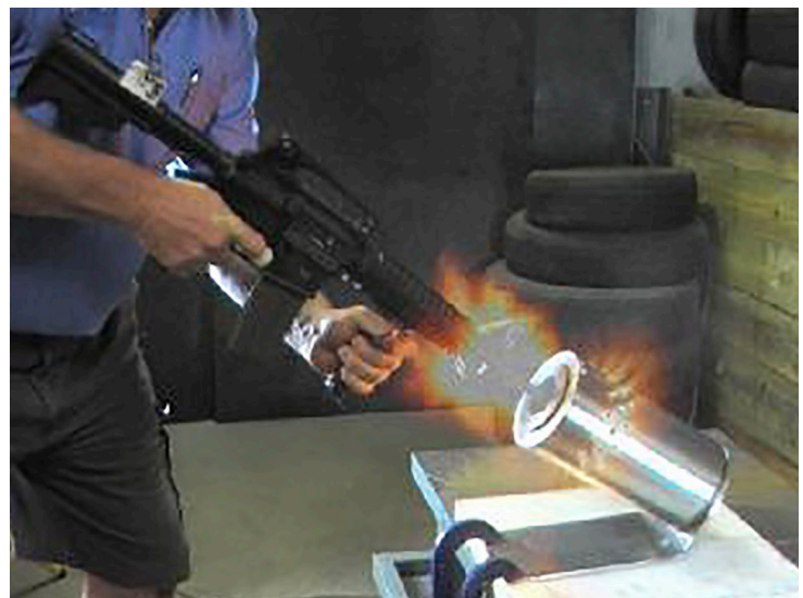
Blaser Sniper Rifle, 0.338 Lapua Magnum APWC (Tungsten core) M16 Carbine full auto