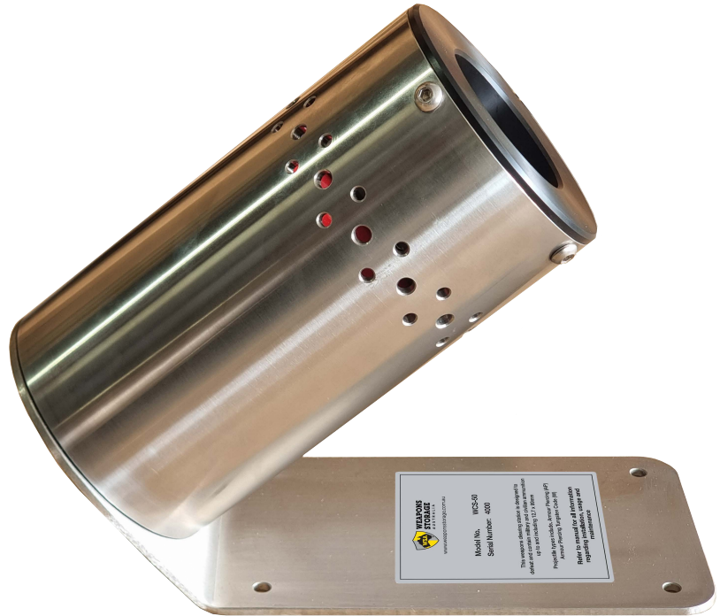
Wall or Desk mountable